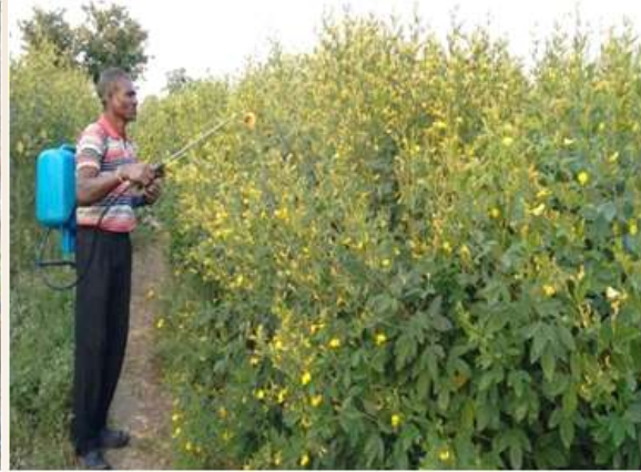
Plant protection measures