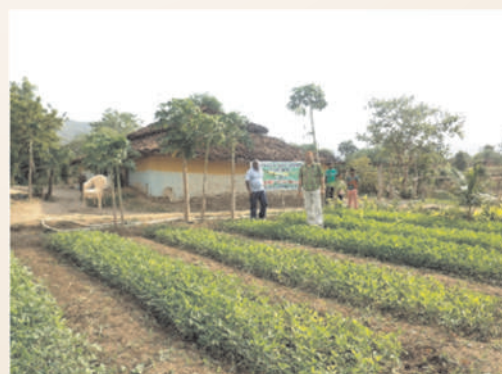
Ready to transplant plants