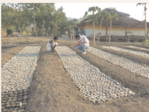
Sowing of seed in polybags